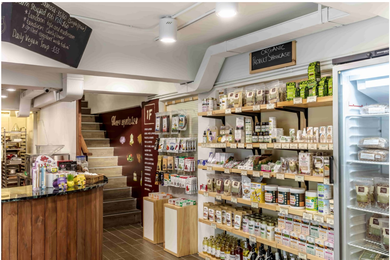
SpiceBox Organics and its selection of sustainable products – even beyond food

and locally sourced ingredients. By using fresh produce and high-quality plant-based proteins, they ensure that every dish is packed with nutrients and bursting with flavor. Their dedication to providing chemical-free and sustainable ingredients extends to their catering services, ensuring that customers can enjoy hearty, delicious meals without compromising their health or the environment.