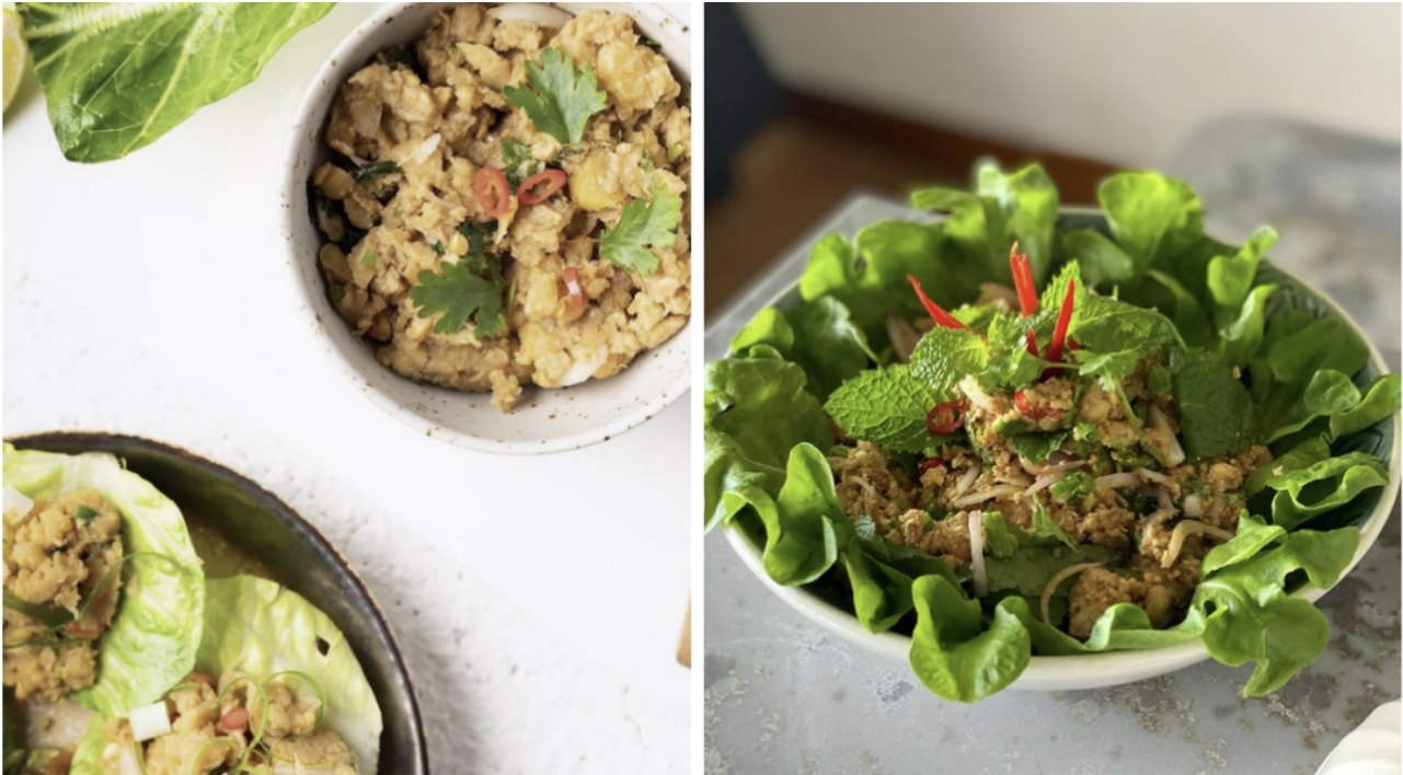
Some of SpiceBox Organics favourites